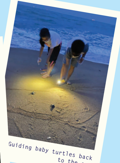
to the sea 103 turtle eggs