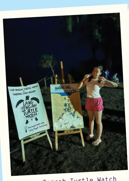
Lang Tengah Turtle Watch @ Tanjong Jara Resort